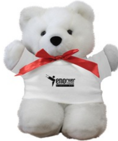
ERMP Teddy Bear